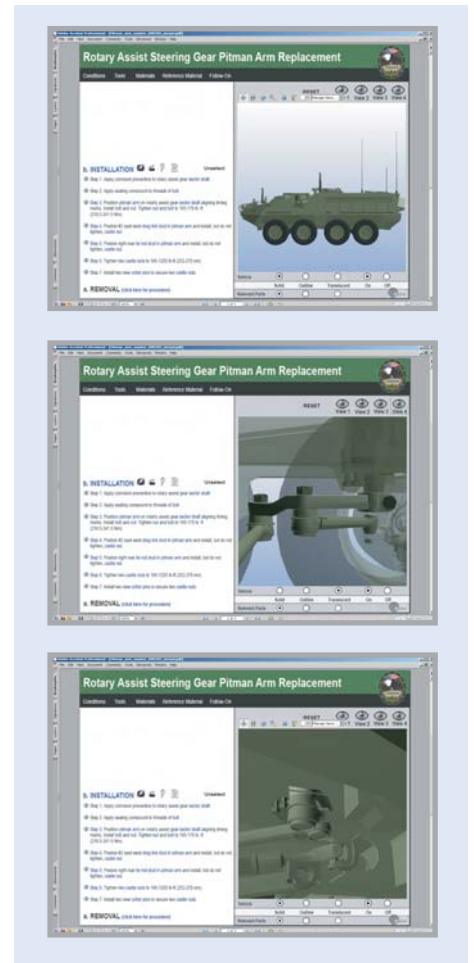
Using Right Hemisphere, you can easily generate and publish 3D graphics directly into Adobe Acrobat PDF to create clear maintenance and repair instructions in IETM form. Example is courtesy of EDS.

Learn more about Right Hemisphere at www.righthemisphere.com