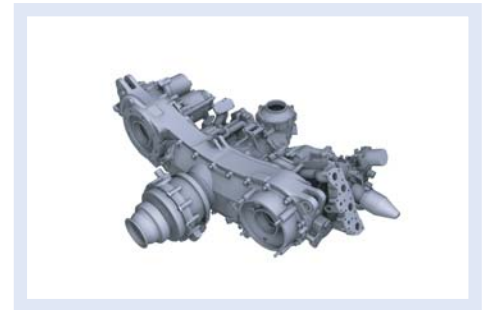
Photorealistic rendering styles