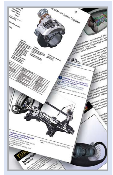
Compelling technical documentation combines 2D and 3D graphics and text.

"Right Hemisphere software tools provide us with the opportunity to fortify our visual pipeline. They are quickly becoming one of the key components of a new process we are developing which enables us to better support all downstream consumers with up-to-date Chrysler Group product geometry data."